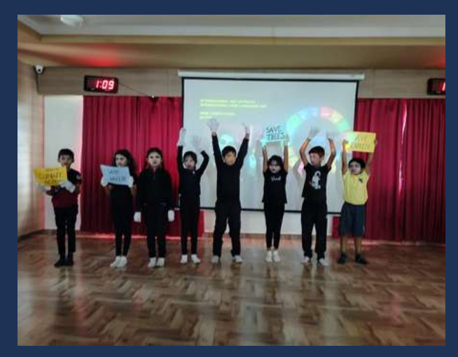
WINNERS Team #Climate Action