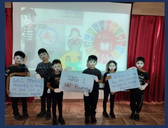
WINNERS Team #No Poverty