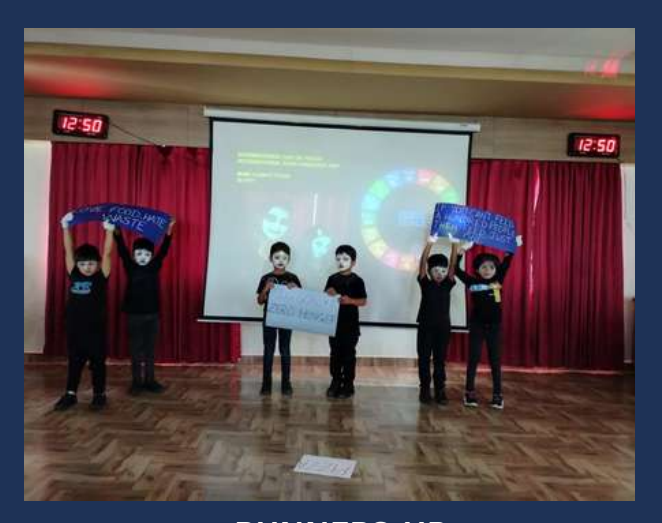
RUNNERS-UP Team #Zero Hunger