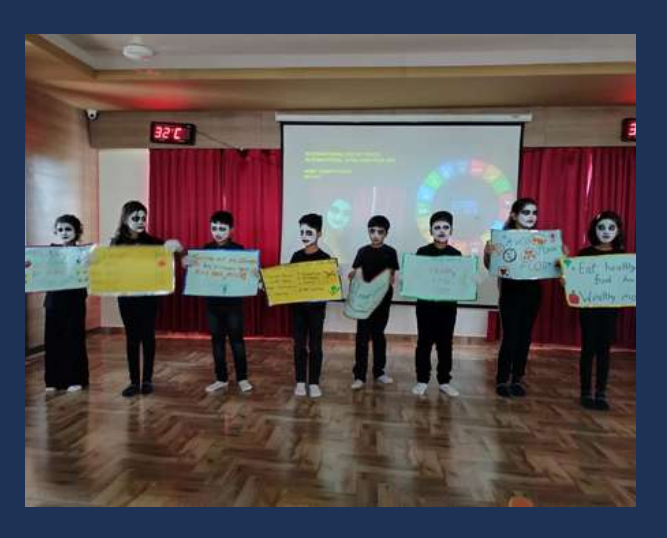
RUNNERS-UP Team #Good Health and Well-being