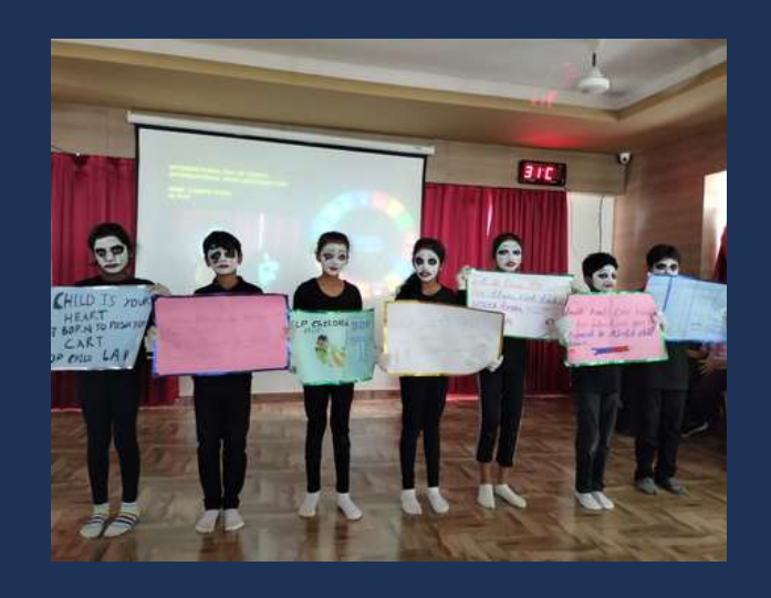
WINNERS Team #Peace, Justice and Strong Institutions