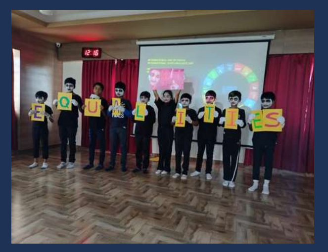
RUNNERS-UP Team #Reduced Inequalities