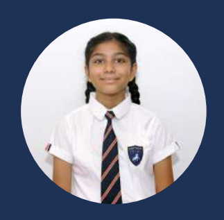
Mrittika PYP 5