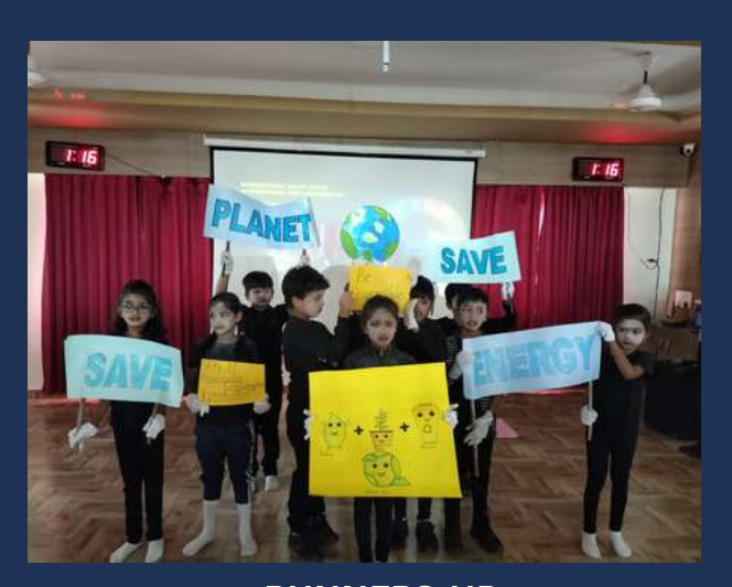
RUNNERS-UP Team #Responsible Consumption and Production