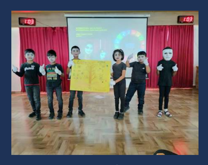
RUNNERS-UP Team #Quality Education