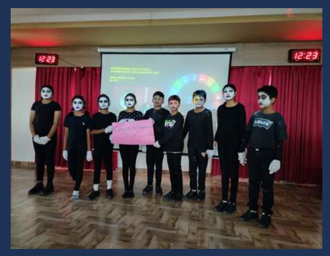
WINNERS Team #Gender Equality