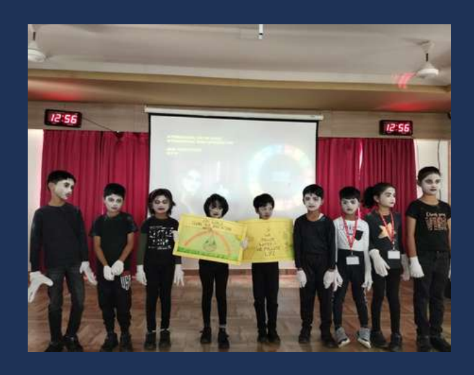
WINNERS Team #Clean Water and Sanitation