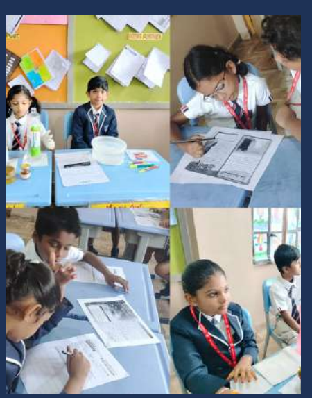
#PYP1 #PYP2 #PYP3